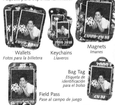
Wallets Fotos para la billetera