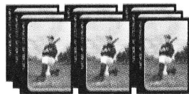
9 cards of your athlete Nueve tarjetas de tu atleta con estadísticas